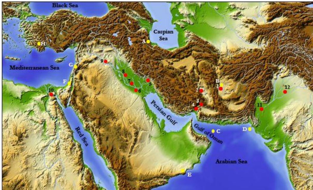
Figure 1. Location of important ancient cities of the third millennium BCE and Paleoclimate sites in the Middle East; (1) Shahr-e Sokhta, (2) Shahdad, (3) Konar Sandal of Jiroft, (4) Tepe Yahya, (5) Susa, (6) Ur, (7) Uruk, (8) Kish, (9) Mari, (10) Memphis, (11) Mohenjo-Daro, (12) Harappa, (A) Lake Neor, (B) Lake Hamoun, (C) M5-422, (D) 63KA, (E) Qunf Cave, (F) Soreq Cave, (G) Jeita Cave, (H) Lake Gölhisar.

The results of these studies reconstruct the climatic conditions and dry events of this period. The socio-political conditions of the civilizations of the third millennium BCE, which relied heavily on water and favorable climatic conditions, are endangered by climate change, which is discussed in this discussion. The main focus of the research is the reasons for the rise and fall of civilizations in the southeastern region of Iran.